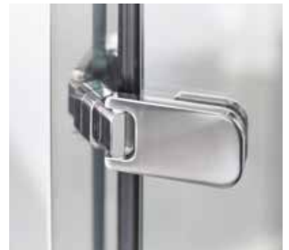
OWN DEVELOPED STAINLESS STEEL ADJUSTABLE HINGES