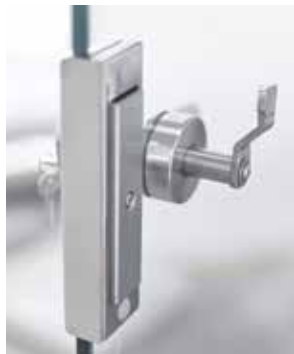
OWN DEVELOPED STAINLESS STEEL HANDLE WITH LOCK