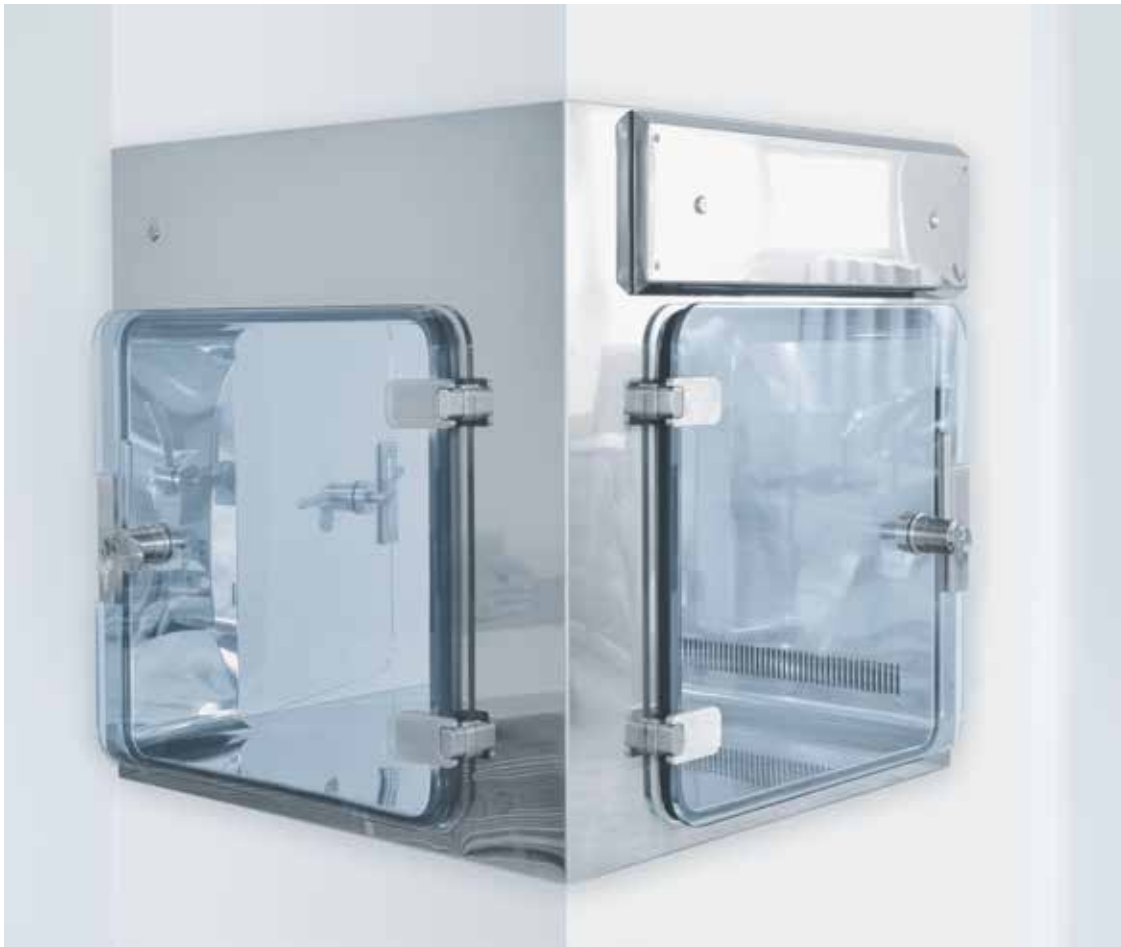
3-WAY PASS BOX